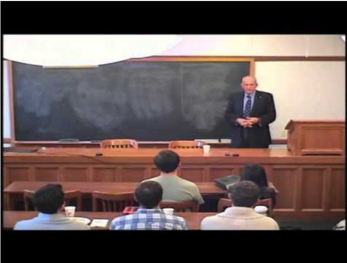
Yale Law School Talk