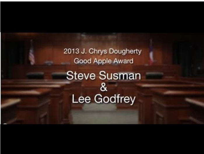
2013 Good Apple Award