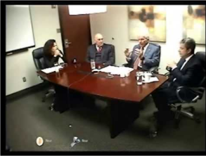
Jury Trial Webinar