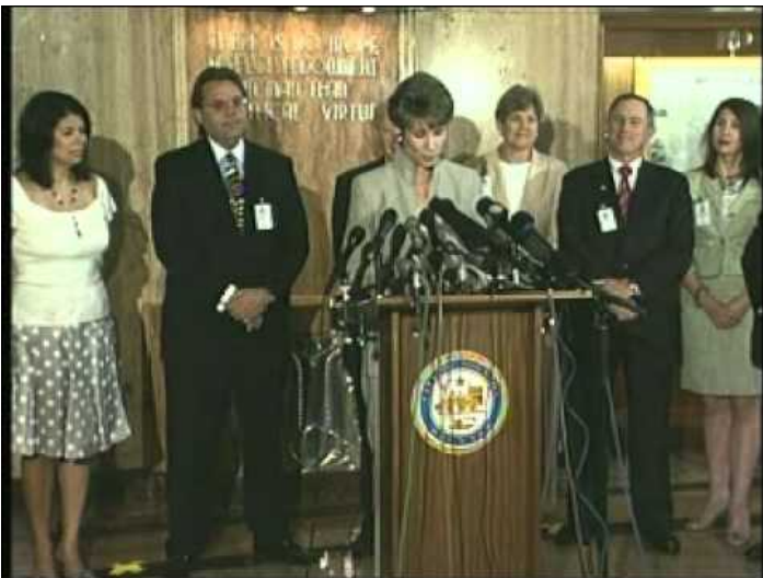
Mayor's Press Conference