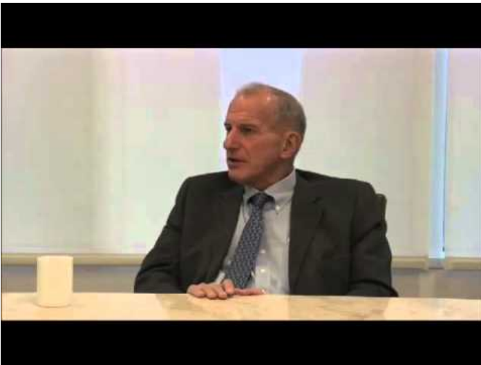
Practice of Law