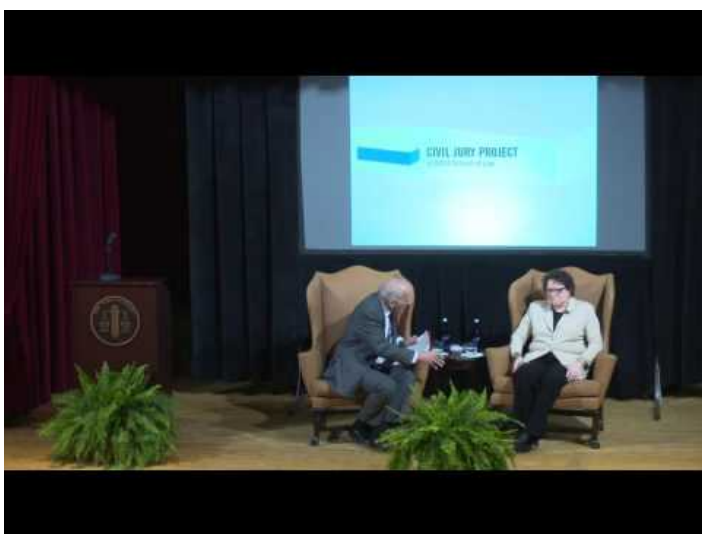
Justice Sonia Sotomayor