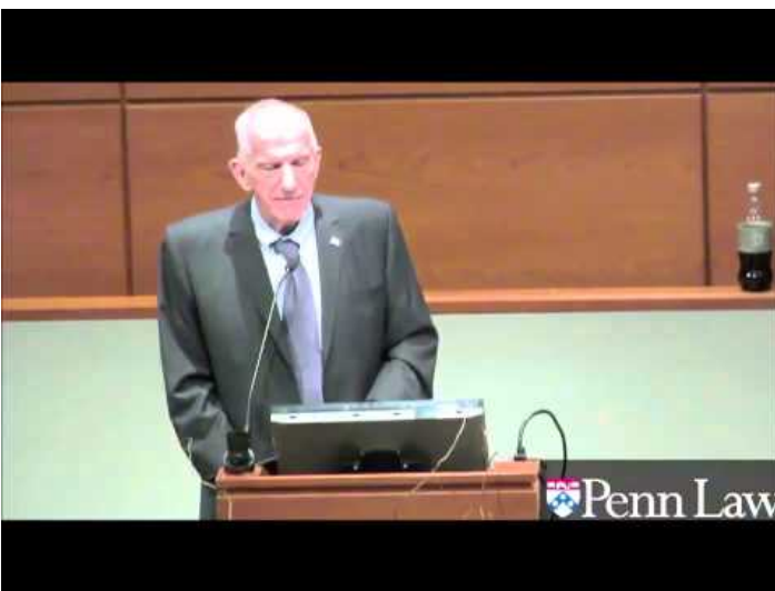
Joy of Lawyering